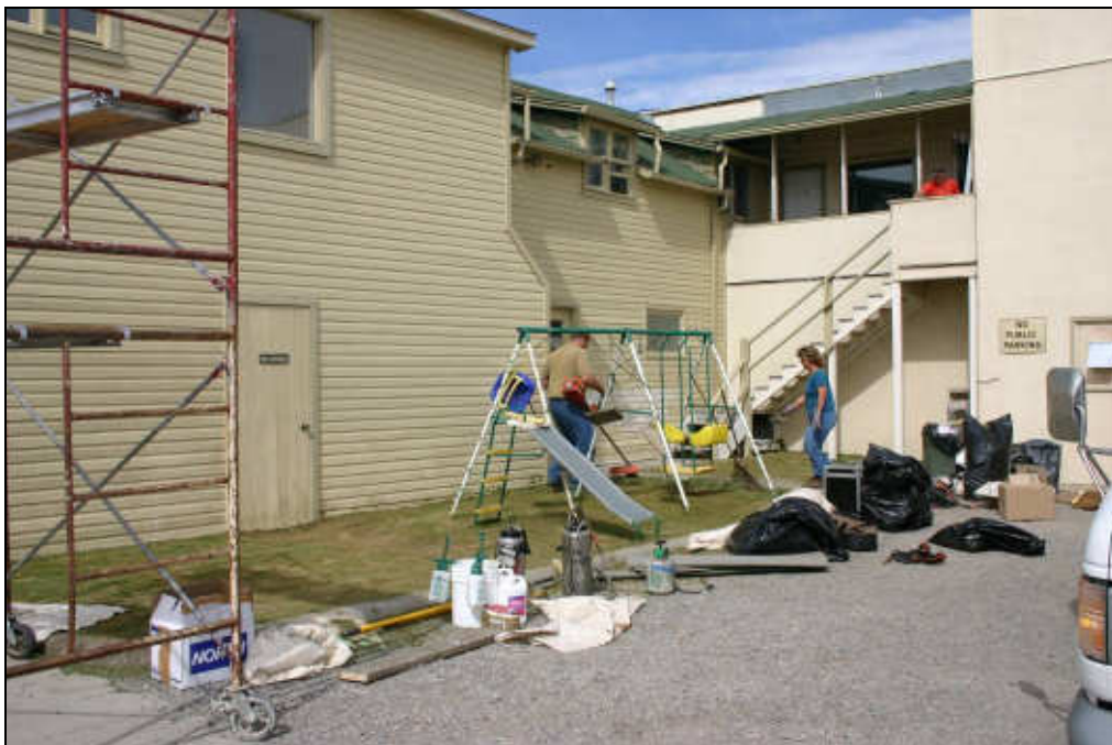
Pre-Production Activity June 2004

Yes, but they talked to us four to six months ahead of time. And of course, they were working there for a couple of months before they started filming.