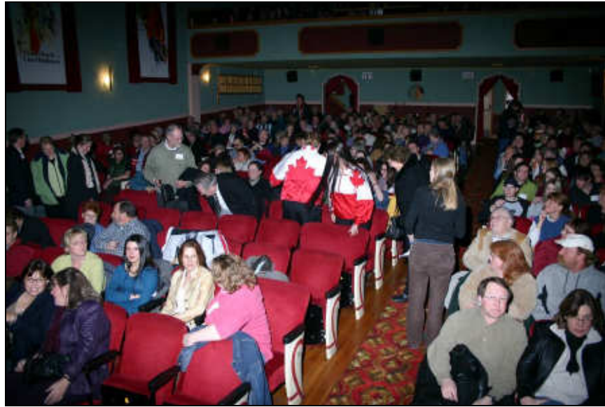
Fort Macleod Brokeback Mountain Premier January 19, 2006