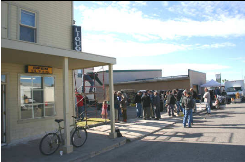
Filming at the Laundry Apartment June 2004

I remember them working into the night. And those lights! Especially for the Fireworks scene. We were out there until 2:00 in the morning! And after we returned home we finally heard the fireworks go off at 4:00! I remember it being cold; we had to have blankets.