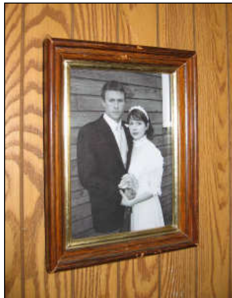
del Mar Wedding Photo

I took a photo of the del Mar wedding picture. And we have some pictures of our kids sitting on their couch! And we have great memories.