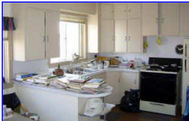
Contributed photo *