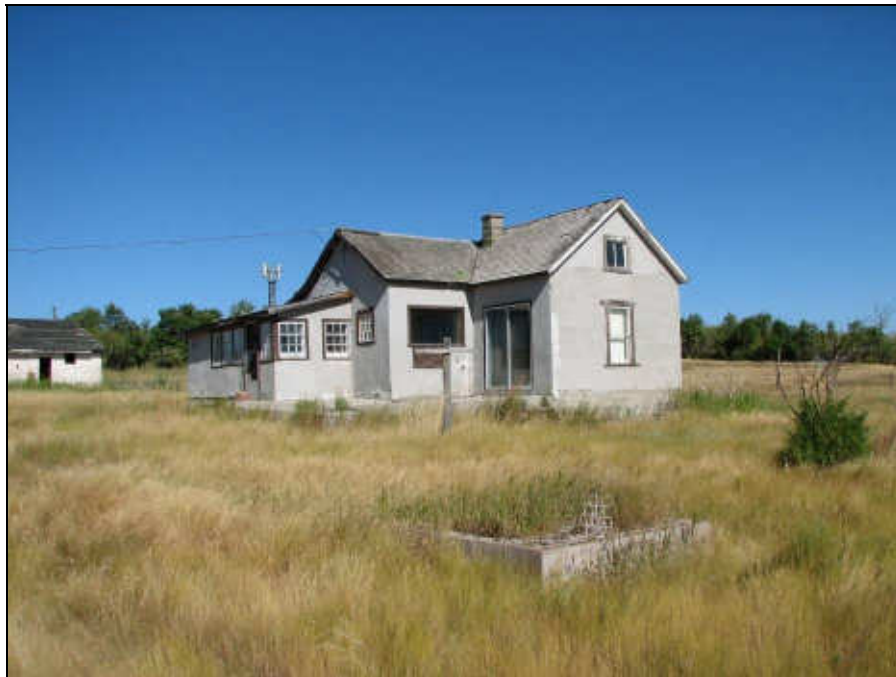
The Lonesome Ranch (Christie Place)