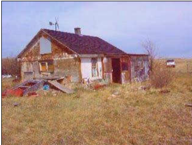
“Before” View of the Divorce Cabin

They actually sent someone to the most expensive place on the planet to buy bundled firewood, the Kananaskis Junction Store. Then they set that guy and his helper to cutting the strapping off and piling it up. They filmed Heath Ledger chopping wood on the north side of the cabin, and we ended up with a lovely pile of expensive firewood.