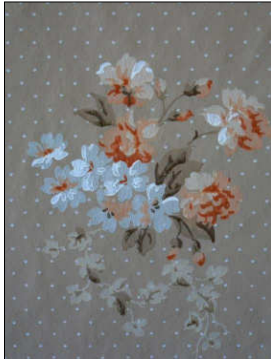
Lonesome Ranch Wallpaper

No, that was original wallpaper, as lovely as it was in 1963.