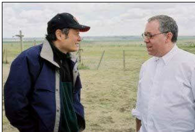
Ang Lee and James Schamus at the Lonesome Ranch

The next thing we knew, there were crews of carpenters and scenery people doing their thing. Then they came rolling down the road with all of the equipment, costuming, and scenery, and whatever else. Eventually the actors showed up, about two weeks after that.