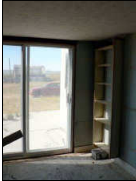
The Girls' Room