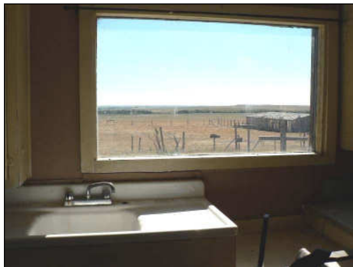
The First of Alma's Sinks

The day they were filming here, in early June, the clothes were being whipped to pieces. They flew off and they had to keep putting them back on.