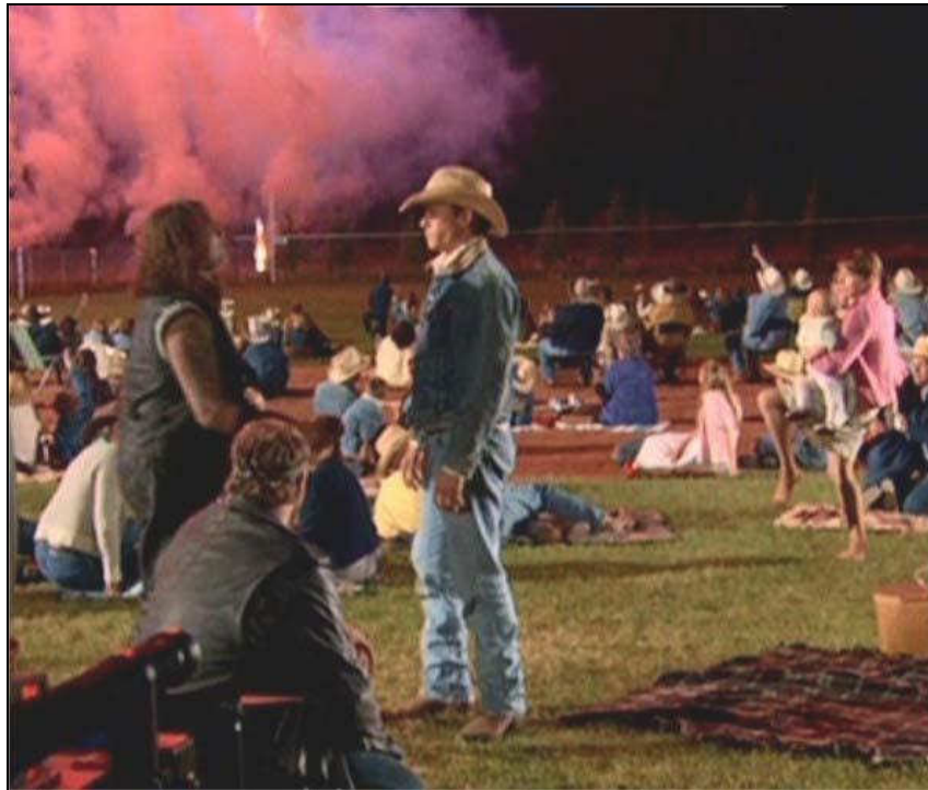
Filming the Fireworks Scene Fort Macleod, Alberta

They did a lot of retakes and changed the angle of the shot a few times. Thankfully, the bikers were mouthing off when my kids were asleep. I am glad we had quilts along because it was cold that night. It was a very interesting experience.