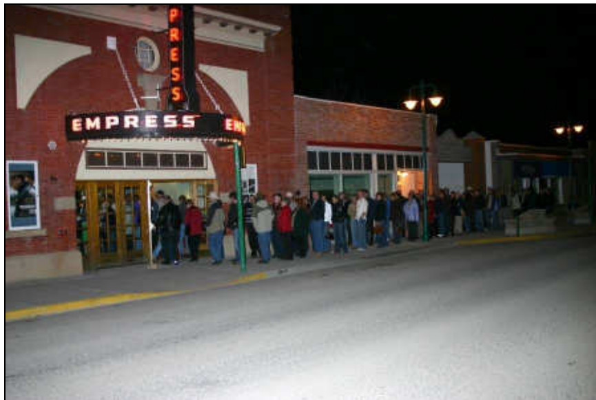
Fort Macleod Premiere of Brokeback Mountain January 19, 2006

With any movie you know it is going to take a couple of years for them to get it on the screen. When Brokeback Mountain finally came out, we went to the premier in Fort Macleod, at the Empress Theatre.