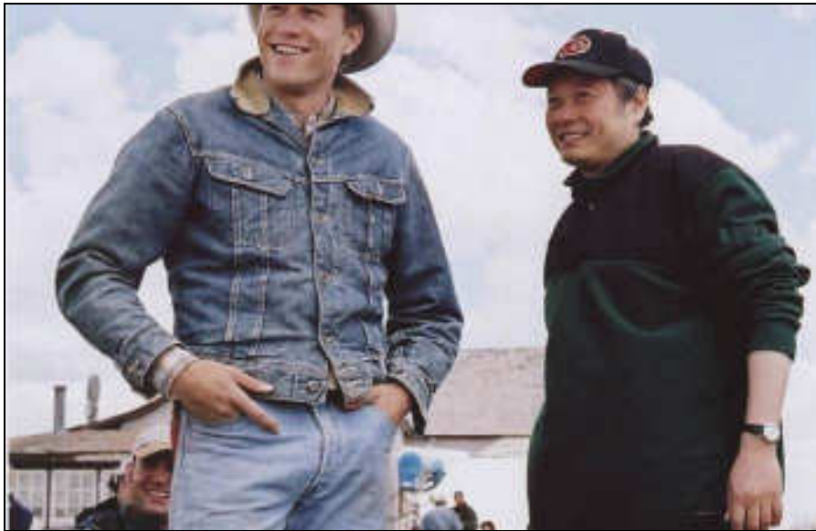
Heath Ledger and Ang Lee at the Lonesome Ranch

The actors were [at the Lonesome Ranch] for two days, and then they came back to do the scene at the [Divorce] Cabin. Jake Gyllenhaal showed up on the second day of shooting.