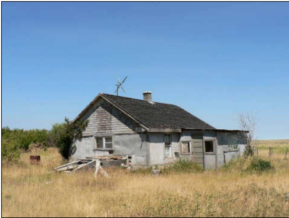
The Divorce Cabin (Harry Enticknap Home)