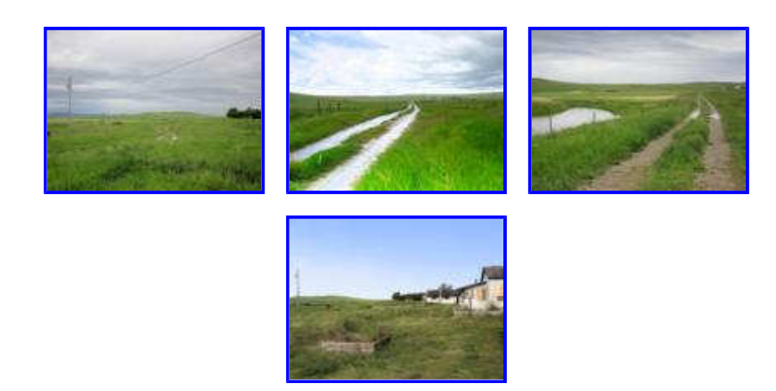
Revised 25 February 2015