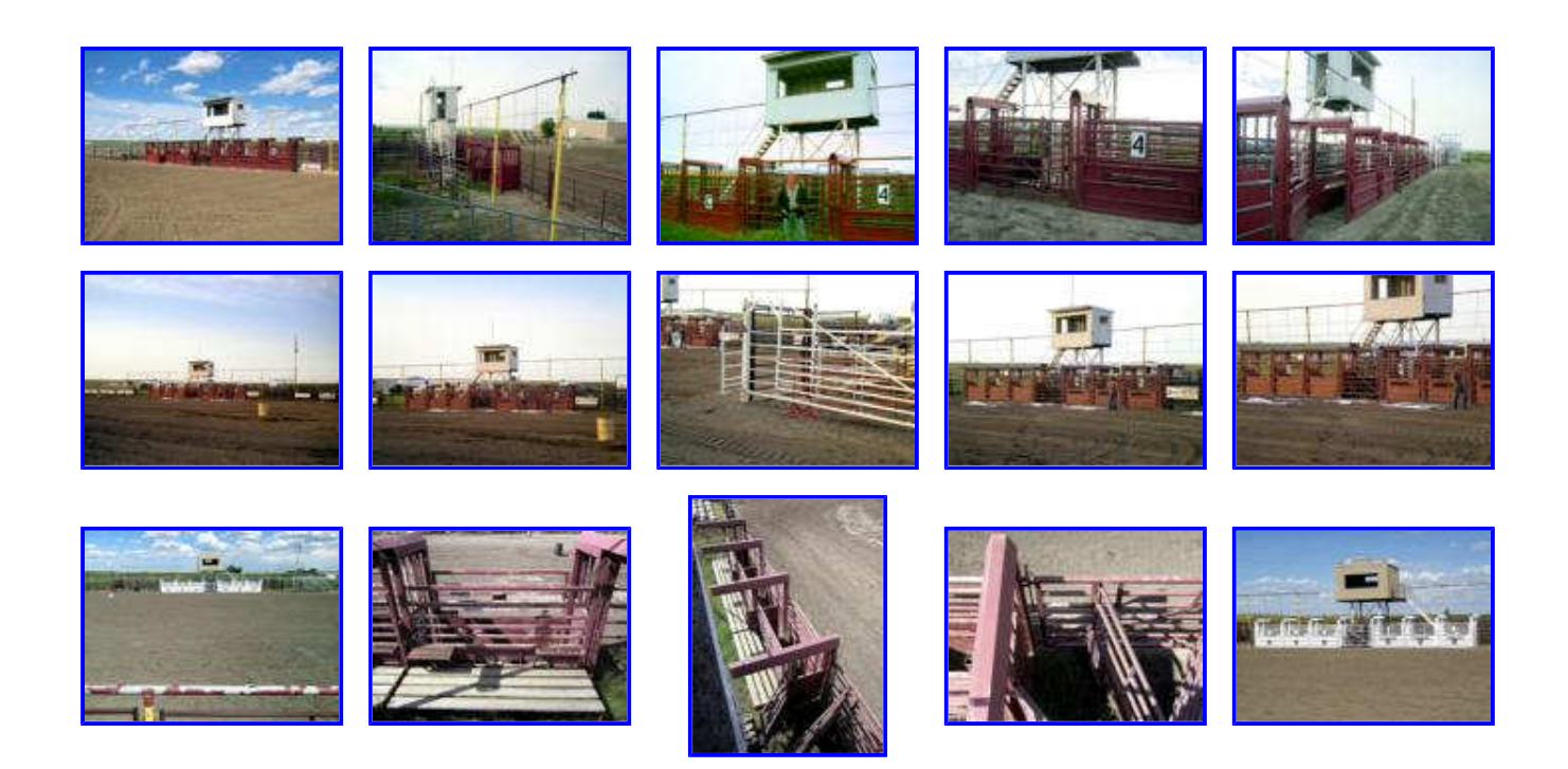
Revised 25 February 2015