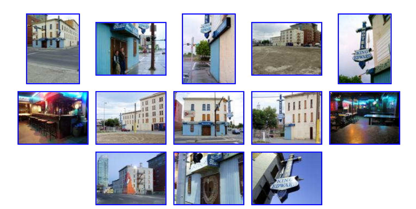
Revised 27 September 2013