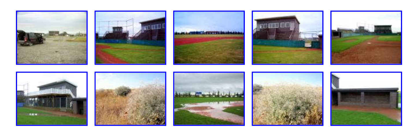
Revised 27 September 2013